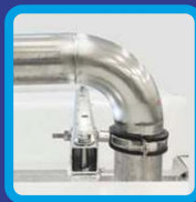
Stainless steel construction & piping