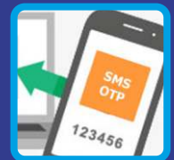
OTP Based Refill System