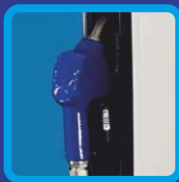
Nozzle with automatic shut off & automatic nozzle holder