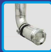
2" dry brake coupling for cistern filling