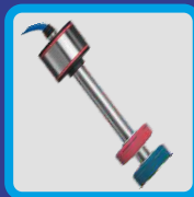
Level Cum Temperature sensor