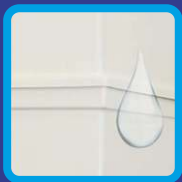
3 Layered Tank