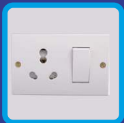
Power Source for Refilling Bowser Pump