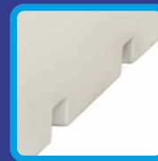
Opening for forklift