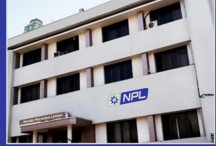
Plot No.96/1, Falandi, Silvassa