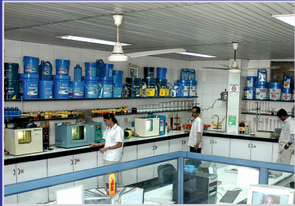
Plot No. J-34, MIDC, Talaja

Our plants are ISO 9001 & 140001 certified with international standard state of art infrastructure with in-house LAB | R&D facilities.