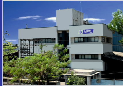
Plot No. J-26, MIDC, Talaja