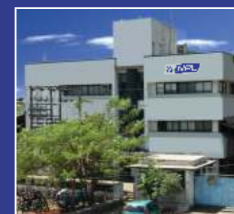
Plot No. J-26, MIDC,Taloja