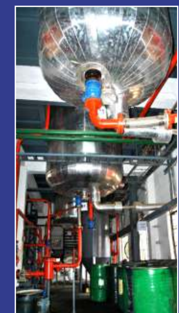
Plot No. J-26, MIDC, Taloja