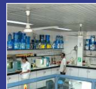
Plot No. J-34, MIDC,Taloja