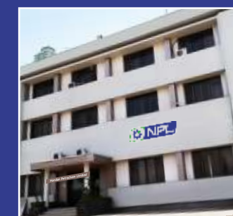
Plot No.96/1, Falandi, Silvassa